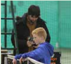
Zum ersten Mal im Einsatz bei den Kirschbaum International: Ballkinder und Linienrichter