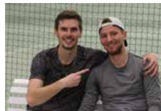
Entspannte Stimmung nach dem Doppelerfolg: Otte (l.) und Kahlke